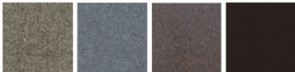
cobblestone gray granite millstone espresso